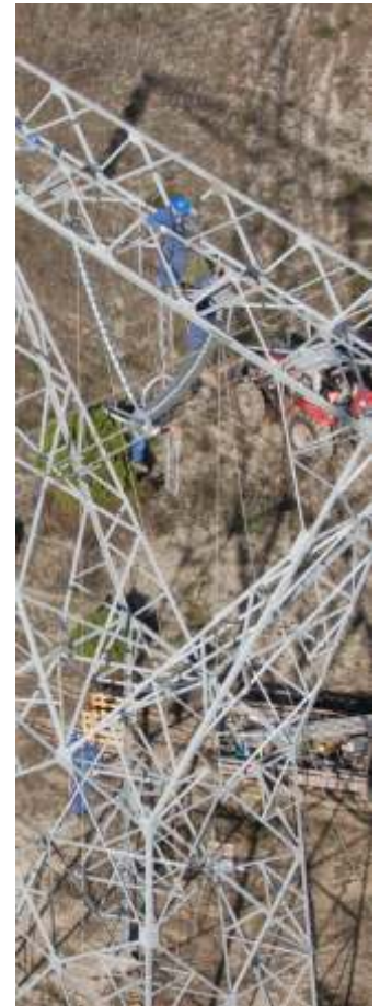
Figure 1 - Substitution of insulator chains in a 400kV line

[1] J. Gomes-Mota 1 , Miguel Ramos 1 , A. Matos-André 2 , "Geographical Information Tools for Overhead Lines Preventive Maintenance", 1 Albatroz Engenharia SA, 2 Labelec SA, CIGRÉ'08.